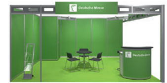
Modular stand Type A – Lime