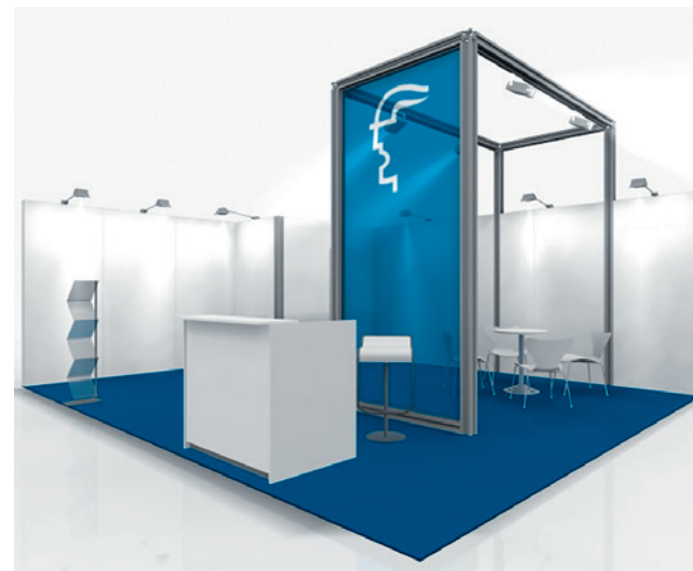
Modular Stand Type C including additional fittings/furniture