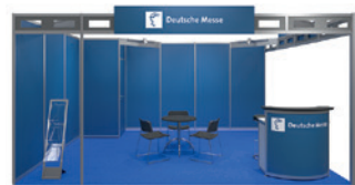
Modular stand Type A – Ocean