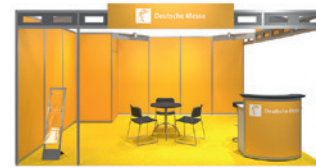
Modular stand Type A – Sunshine