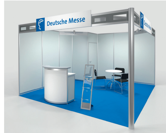
Modular Stand Type A including extended furnishings pack