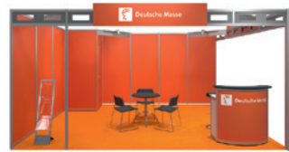
Modular stand Type A – Orange