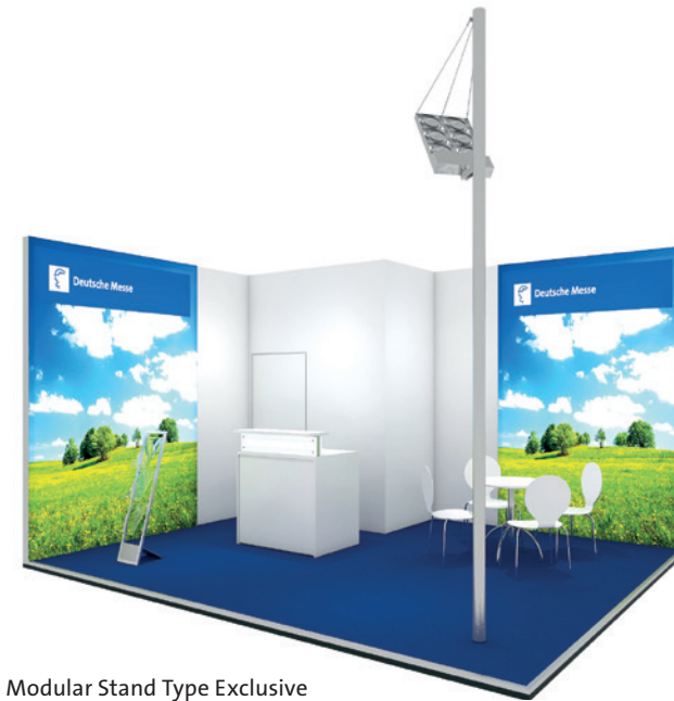
Modular Stand Type Exclusive

*** 20 m 2 Row stand with early booking, One-Year Contract