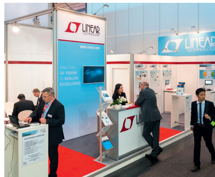
Sample design – with additional features available at extra cost