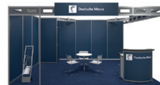
Modular stand Type A – Midnight