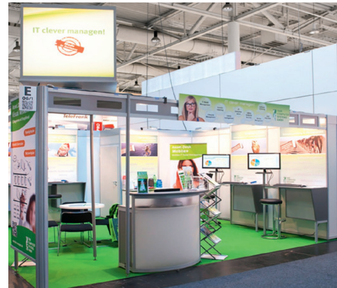
Sample design – includes additional features available at extra cost