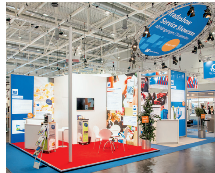
Sample design – with additional features available at extra cost